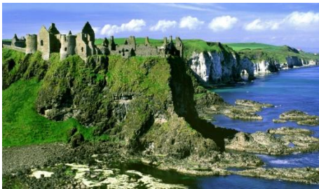
Ring of Kerry