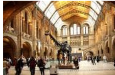
Natural History Museum