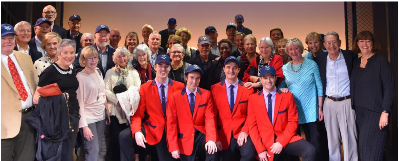
Jersey Boys at West End's Piccadilly Theatre.