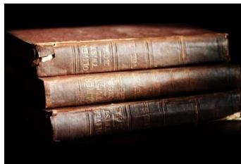
Charles Dickens Museum*