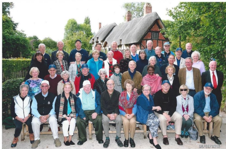
In front of Anne Hathaway's home in Stratford-on-Avon