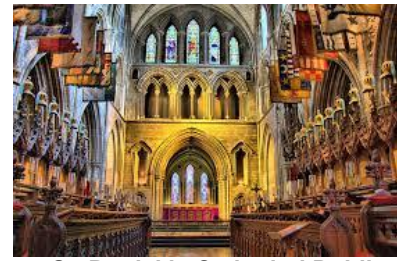
St. Patrick's Cathedral Dublin