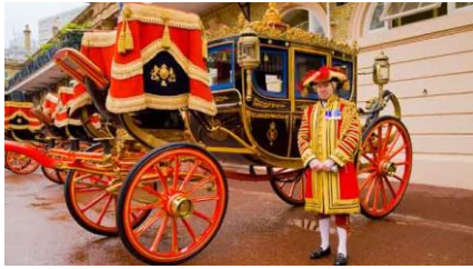
Royal Mews – Buckingham Palace

LONDON, ENGLAND, WALES, IRELAND AND SCOTLAND 21 Days London/London - September 12 th – October 3 rd , 2017