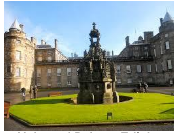
Holyrood Palace Edinburgh