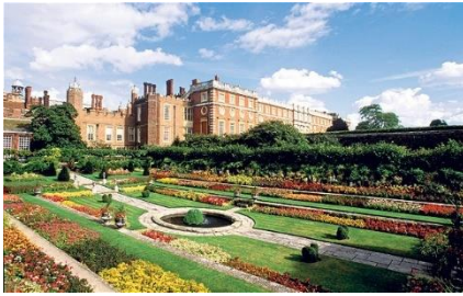
Hampton Court Palace Gardens