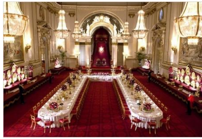
Buckingham Palace Staterooms