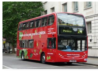
London Hop-on Hop-off Bus