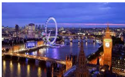
London at night