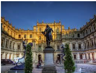
Royal Academy of Arts*