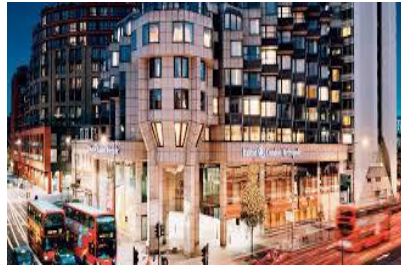
LONDON - Hilton Metropole