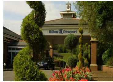
NEWPORT - The Coldra Court