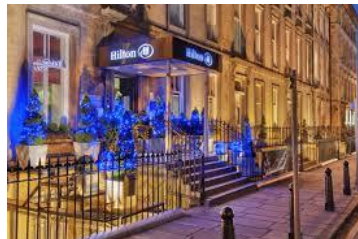
EDINBURGH - Hilton Grosvenor