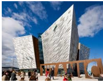
Titanic Museum - Belfast