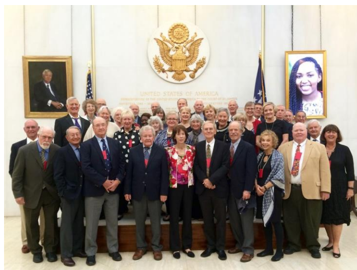
At the U.S. Embassy in London