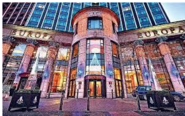
BELFAST - Europa