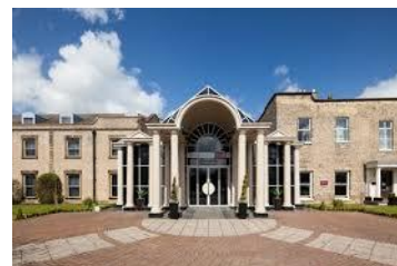
YORK - Mercure Fairfield Manor