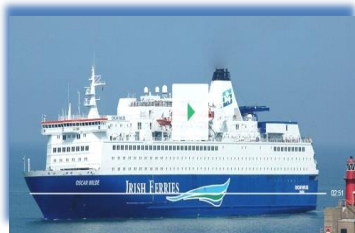
Ferries across the Irish Sea