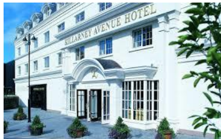
KILLARNEY - Killarney Avenue