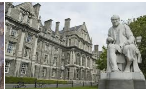
Trinity College Dublin