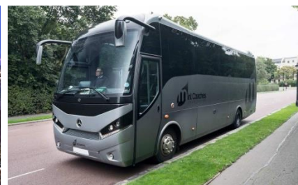
Mint Coaches around London