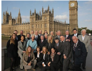
British Tours Group