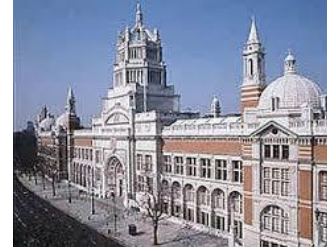
Victoria and Albert Museum