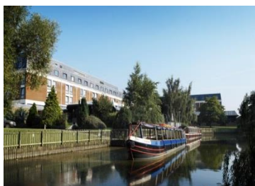
STRATFORD-ON-AVON Holiday Inn