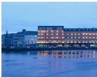
WATERFORD - Granville