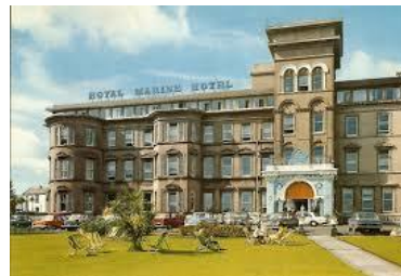
DUBLIN - Royal Marine