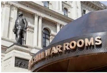
Churchill War Rooms