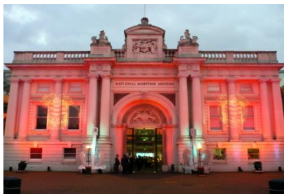
Greenwich - National Maritime Museum