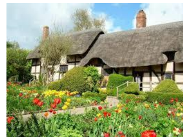
Anne Hathaway Cottage