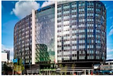
LONDON - Park Plaza Westminster