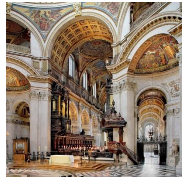
St. Paul's Cathedral