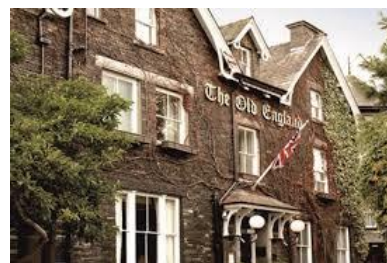
WINDERMERE-MacDonald Old England