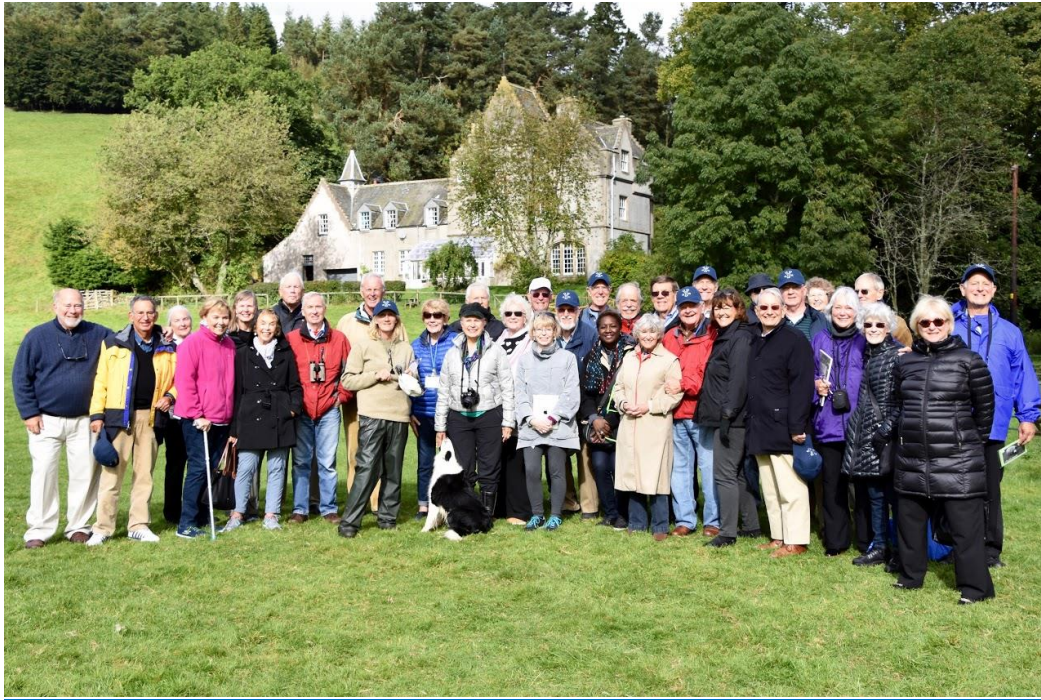
Neth Hill sheep herding demonstration in Carthant, Scotland