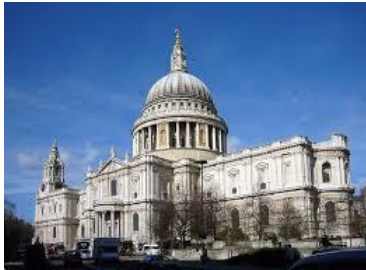
St. Paul's Cathedral