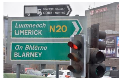
Limerick and Blarney