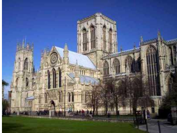
York Minster Cathedral