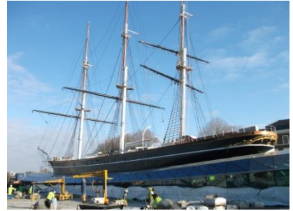
Greenwich Maritime Museum