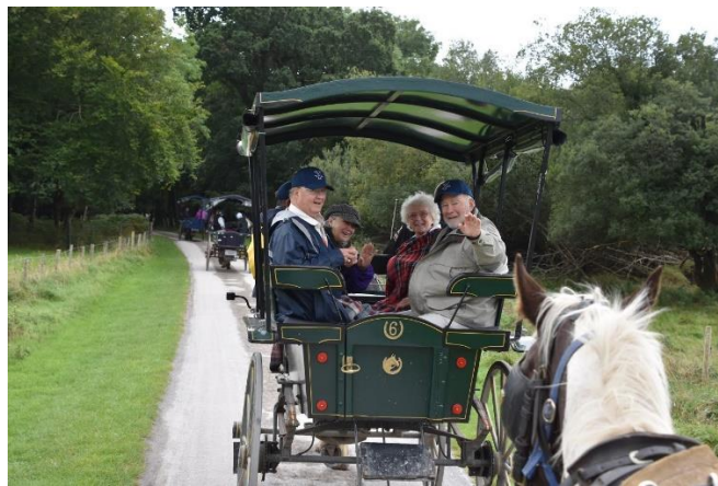
Jaunting Car wagon ride in Killarney