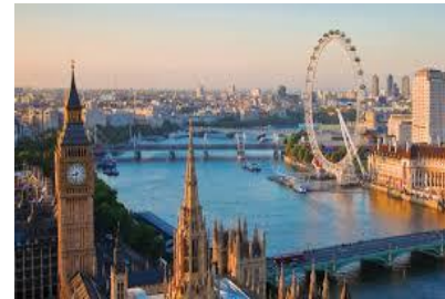
Big Ben, Parliament, London Eye