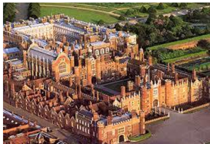
Henry VIII's Hampton Court Palace