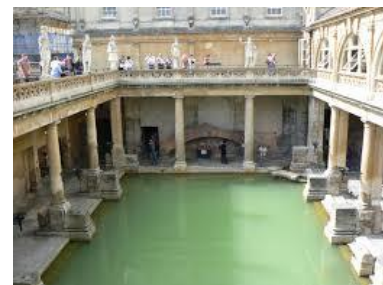
Roman excavations in Bath