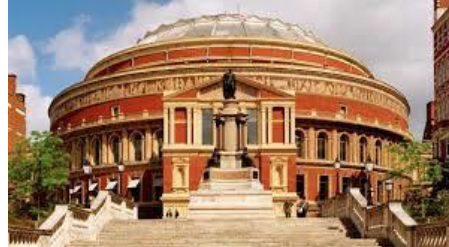
Royal Albert Hall*