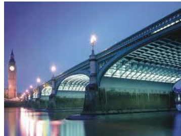
Westminster Bridge (near our hotel)